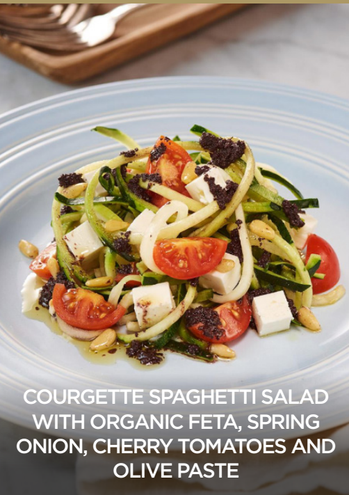
COURGETTE SPAGHETTI SALAD WITH ORGANIC FETA, SPRING ONION, CHERRY TOMATOES AND OLIVE PASTE

If you cannot get the spaghetti, you can grate the courgette with a coarse grater or cut it into thin strips. Fresh herbs like basil, sage, thyme, rosemary, parsley, etc., can be used.