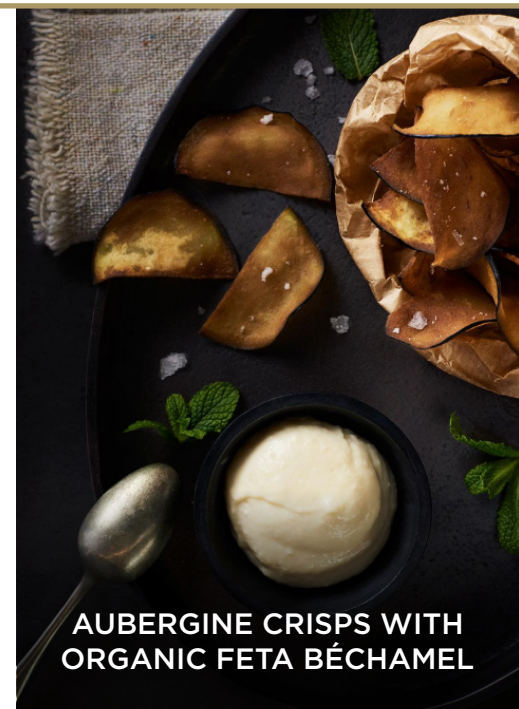
AUBERGINE CRISPS WITH ORGANIC FETA BÉCHAMEL

You can substitute the aubergine crisps with other shop-bought vegetable crisps. Wine: Pommery Brut Royal Champagne