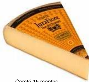
Comté 15 months.